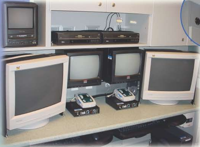
Polysomnogram Control Center